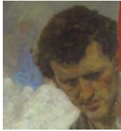
LAURA KNIGHT MYSTERY